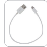
Lightning™ connector cable for iPad Gen. 4 & iPad mini