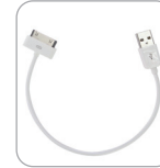
30-pin connector cable for iPad Gen. 1-3